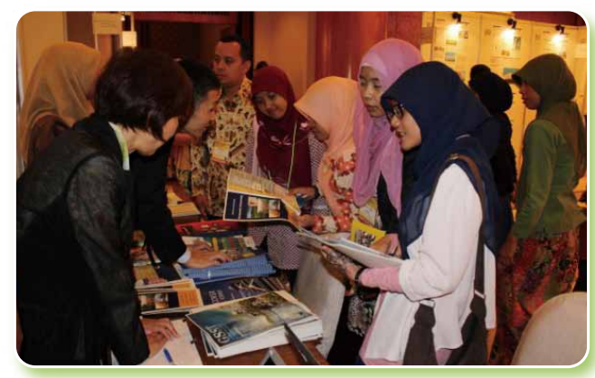
Indonesian students asking eagerly on the opportunity for studying in Kumamoto University

ITS, and UNAIR. In the afternoon, participants were divided into two venues according to the natural sciences- and life sciences-related group and human and social sciences-related group, and were given an introduction to the faculties and graduate schools of those universities from Indonesia and Japan, as well as presen-