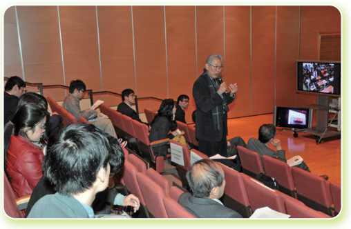
Active discussions by the participants: the workshop was delivered to Gifu University via the teleconference system (right)