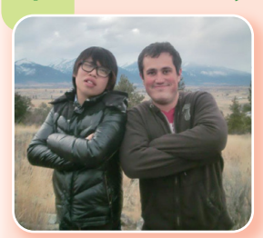
Department of Communication and Information Studies, Faculty of Letters