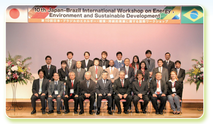
Commemorative photo of speakers and people involved