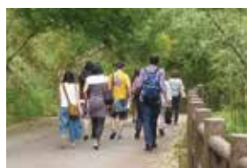
Tatsuda Nature Park