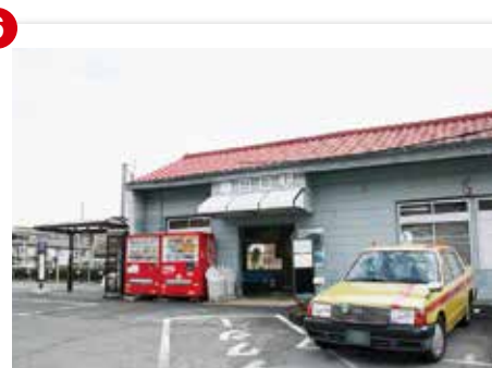
Tatsudaguchi Train Station