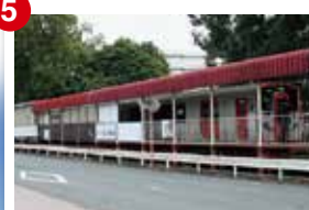
Tokaigakuen-mae Train Station