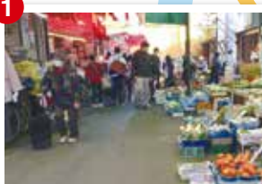
Kokai Market Street