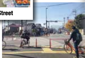
Kokai Market Street