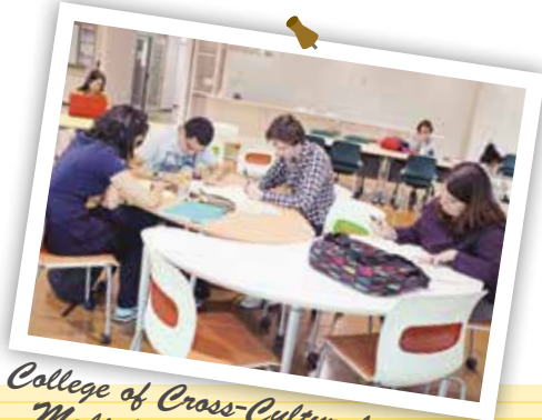
College of Cross-Cultural and Multidisciplinary Studies