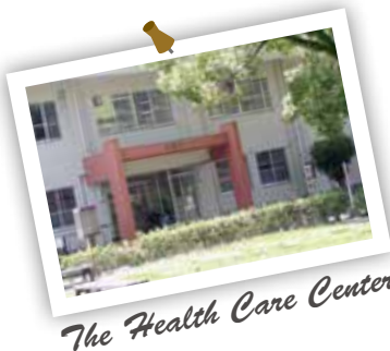
The Health Care Center