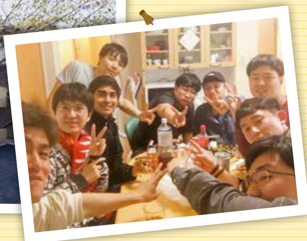
Student Dormitory, International House