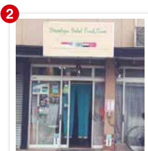
Halal Food Shop